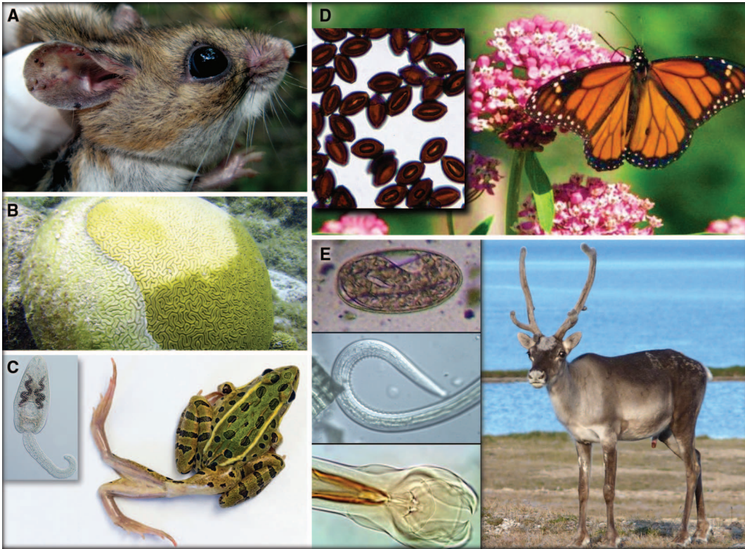
Fig. 1. Animal-parasite interactions for which field or experimental studies have linked climate change to altered disease risk. (A) Black-legged ticks, Ixodes scapularis , vectors of Lyme disease, attached to the ears of a white-footed mouse, Peromyscus leucopus , show greater synchrony in larval and nymphal feeding in response to milder climates, leading to more rapid Lyme transmission. (B) Caribbean coral ( Diploria labyrinthiformis ) was affected by loss of symbionts, white plague disease, and ciliate infection during the 2010 warm thermal anomaly in Curaçao. (C) Malformed leopard frog ( Lithobates pipiens ) as a result of infection by the cercarial stage (inset) of the multihost trematode R. ondatrae ; warming causes nonlinear changes in both host and parasite that lead to marked shifts in the timing of interactions. (D) Infection of monarchs ( D. plexippus ) by the protozoan O. elektrosirra (inset) increases in parts of the United States where monarchs breed year-round as a result of the establishment of exotic milkweed species and milder winter climates. (E) Infection risk with O. gruehneri (inset shows eggs and larvae) the common abomasal nematode of caribou and reindeer ( R. tarandus ), may be reduced during the hottest part of the Arctic summer as a result of warming, which leads to two annual transmission peaks rather than one (e.g., Fig. 3C).

warming involves infusing epidemiological models with relations derived from the metabolic theory of ecology (MTE). This approach circumvents the need for detailed species-specific development and survival parameters by using established relations between metabolism, ambient temperature, and body size to predict responses to climate warming (23). One breakthrough study (12) used MTE coupled with traditional host-parasite transmission models to examine how changes in seasonal and annual temperature affected the basic reproduction number ( R_0 ) of stronglyid nematodes with direct life cycles and transmission stages that are shed into the environment. By casting R_0 in terms of temperature-induced tradeoffs between parasite development and mortality, this approach facilitated both general predictions about how infection patterns change with warming and, when parameterized for Ostertagia gruehneri , a nematode of caribou and reindeer (Fig. 1), specific projections that corresponded with the observed temperature dependence of parasite stages. More-